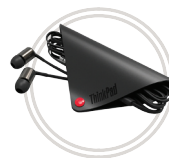
ThinkPad® X1 In Ear Headphones

Superior sound quality with a comfortable fit