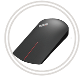
ThinkPad® X1 Wireless Touch Mouse

Wirelessly connect and expand the function of your device