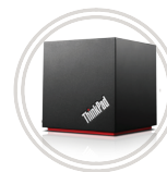
ThinkPad® WiGig Dock

Superior sound quality with a comfortable fit